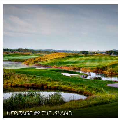
HERITAGE #9 THE ISLAND

A target style design with numerous elevation changes & city views.