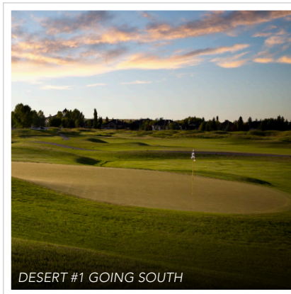
DESERT #1 GOING SOUTH

A traditional design with many risk reward opportunities including the par 5 island green.