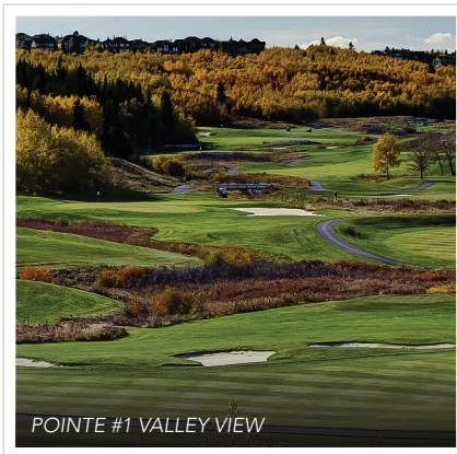
POINTE #1 VALLEY VIEW