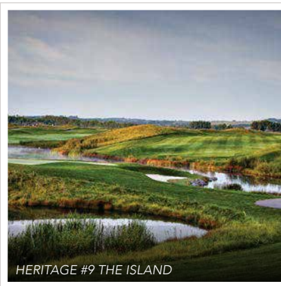
HERITAGE #9 THE ISLAND

A target style design with numerous elevation changes & city views.