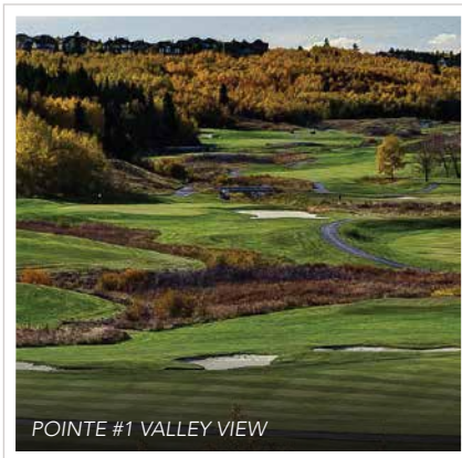
POINTE #1 VALLEY VIEW