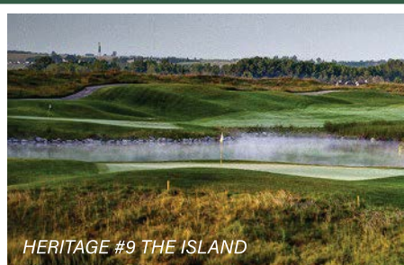
HERITAGE #9 THE ISLAND