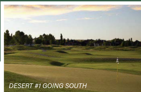
DESERT #1 GOING SOUTH